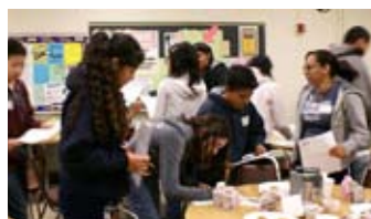
Getting to talk to each other about their school food experiences during the Human Bingo activity.